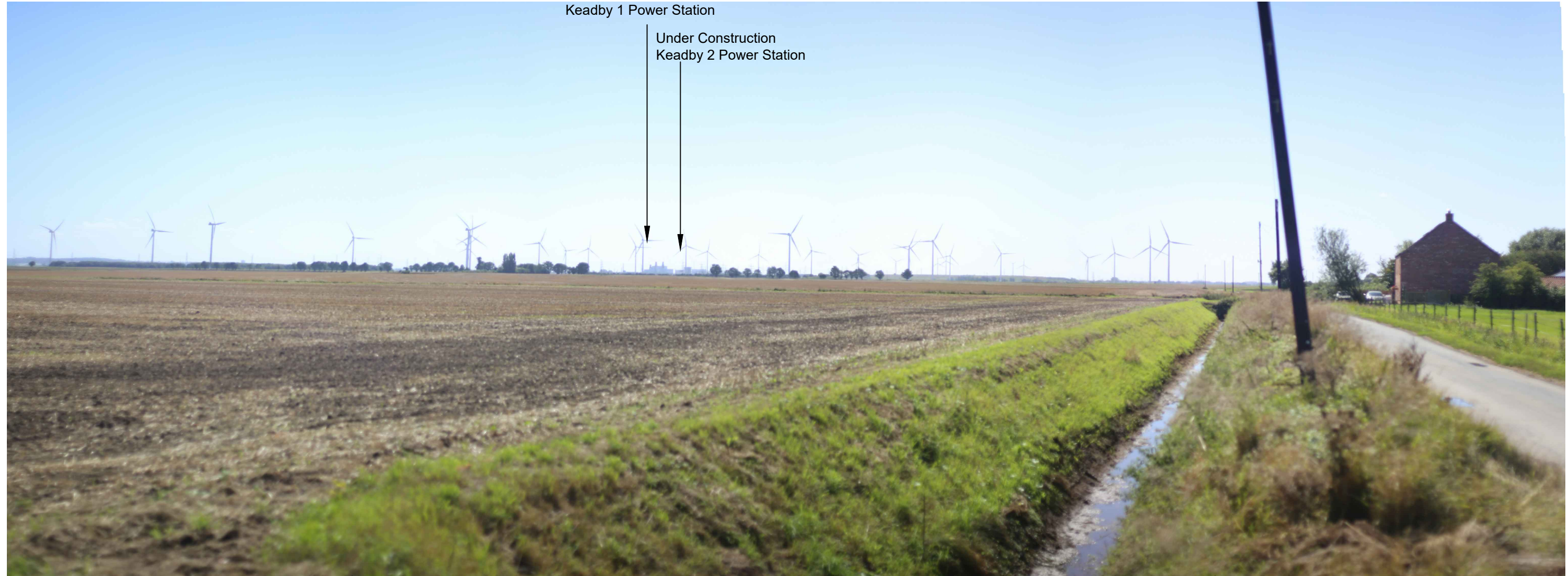
Extent of 50mm single frame image

Project Management Initials: SE Designer: RL Checked: RC Approved: NW Last saved by: BECCALITTLE (2021-05-07) Last Plotted: 2021-05-12 Filename: \UK\DS2\PPSW\001\LE_PROJECTS\NEW\PROJECTS\NEW\PROJ\60625943 - SSE KEADBY AND MEDWAY DC\002 SSE KEADBY\05 TECHNICAL DISCIPLINES\13 LANDSCAPE AND VISUAL\FIGURES\KEADBY VIEWPOINT FIGURE\PHOTOVIEWPOINT 060625943.DWG